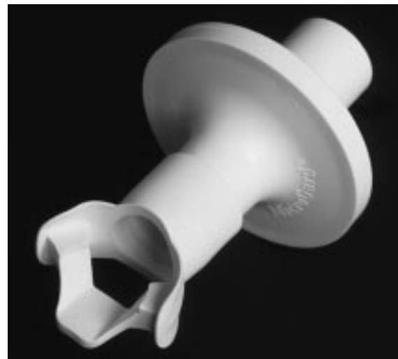
Figure 2. MicroGard Plus. Includes MicroGard filter and FreeFlow™ mouthpiece.