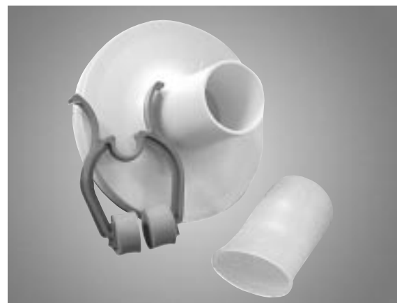
Figure 3. MicroGard PFT Test Kit. Includes MicroGard filter, nose clip, and plastic mouthpiece.